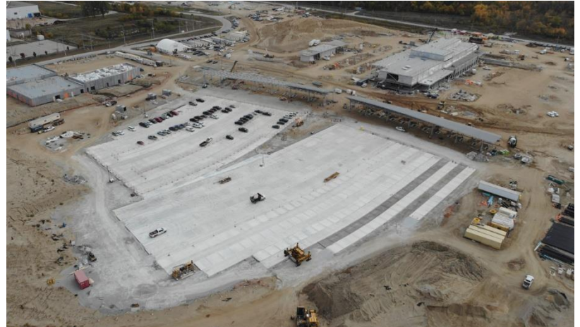
Canadian Port of Entry primary inspection lanes.

Work is underway on all buildings and canopy structures. The POE buildings continue to take shape with some in early construction, with excavation and foundation work underway, while others have progressed further with installation of roofing, building façade, stud and block walls, and interior rough-ins for mechanical, electrical and HVAC systems.