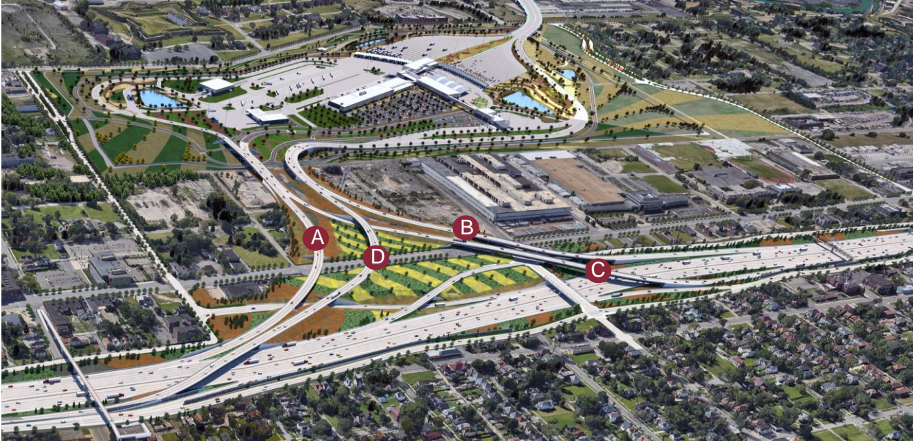
Conceptual rendering showing ramps connecting I-75 to the US POE