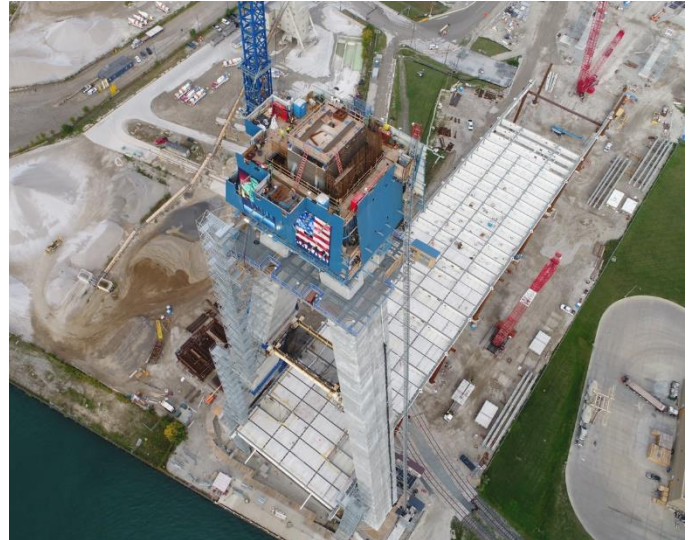
US tower and bridge deck construction

The bridge tower legs have joined together on the Canadian and US sites and continue to climb as single pylons, with both now reaching more than 152 metres/ 500 feet. Each tower is composed of 51 different segments that are being constructed using a jump form climbing system that “jumps” vertically every 4.5 metres/15 feet. The project team has just under 18 cement pours left until the bridge towers reach their final heights of 220 metre/722 feet.