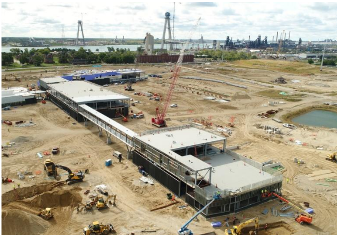
US Port of Entry facility construction

Construction activities are advancing at the US Port of Entry as the buildings and canopies also take form. Underground utilities, electrical and plumbing work continues at some buildings, while foundation and structural work is underway at others.