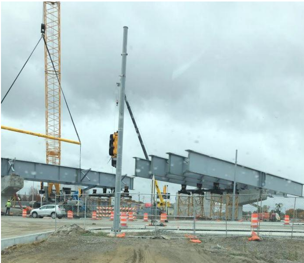
Girder installations taking place on I-75

Work is underway on the new ramps that will connect I-75 to the US POE. These new structures will be located between Campbell Street and Livernois Avenue and will provide an overpass above Fort Street and I-75 lanes and on/off ramps.