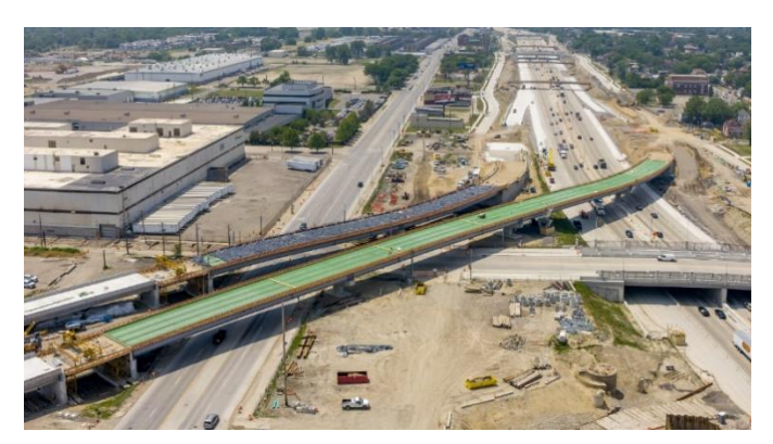
I-75 to US POE ramp construction.

Siphon work is anticipated to begin at Morrell Street and Ferdinand Street over the coming months.