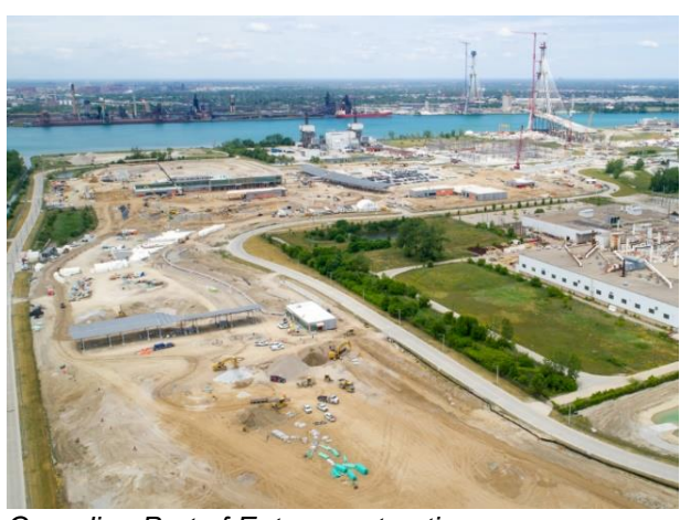
Canadian Port of Entry construction.

Beam erection, formwork and concrete pours are taking place on the return to US overpass bridge in the Port of Entry.