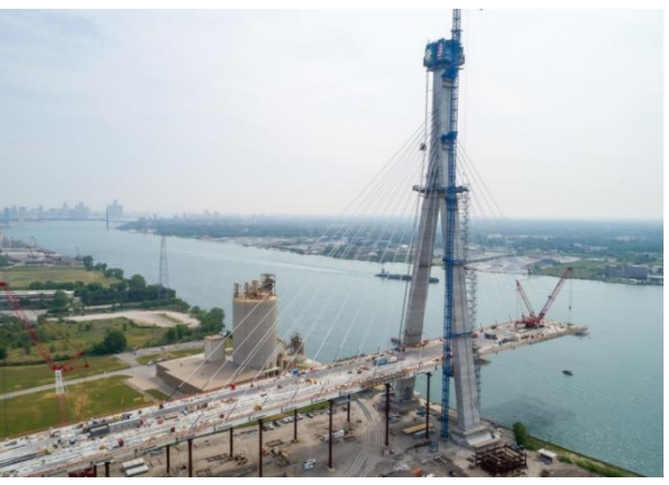
US Bridge site construction