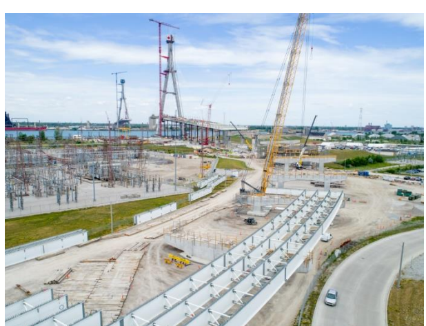
US and Canadian bridge construction (right). Canadian bridge construction (left).