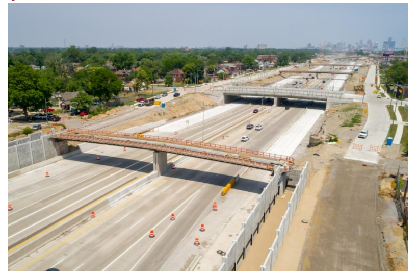
Road and pedestrian bridge construction

All five pedestrian bridges are currently under construction. Activities include utility work and abutment construction. Girder installations are anticipated to begin on the Junction Avenue and Lansing Street pedestrian bridges in the coming months.