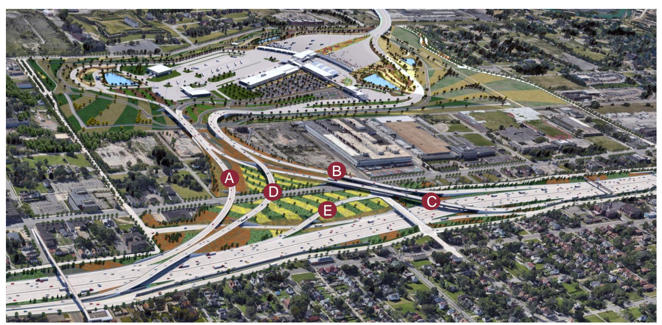
Design rendering of I-75 and US POE connector ramps