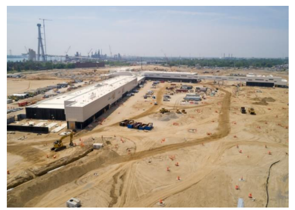
US Port of Entry construction.