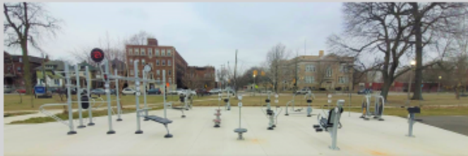
Newly installed fitness equipment in Clark Park, Southwest Detroit.

As part of McKee Park improvements, the City of Windsor has installed a new gazebo and enhanced the existing boardwalk. The improvements, along with other enhancements to park paths, lights and benches, represent the $200,000 initiative.