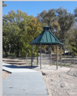
A new gazebo and enhanced boardwalk at McKee Park, Sandwich.