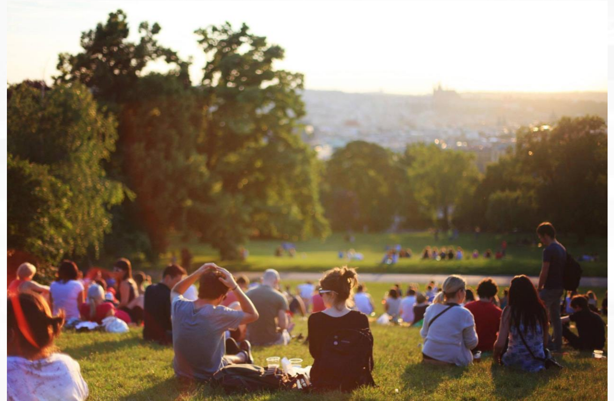
US Bridge Site