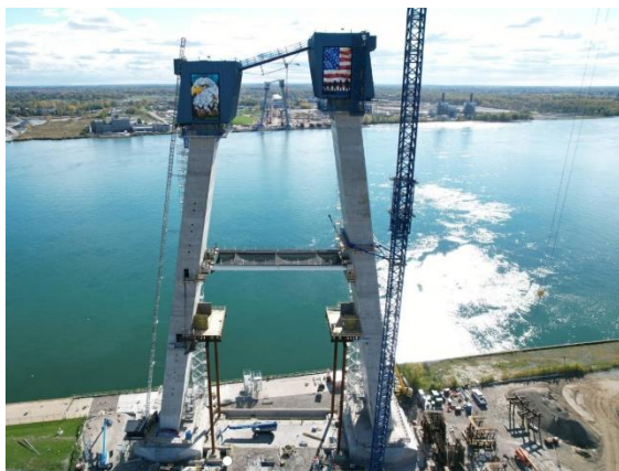
US bridge tower work

The total height of the tower is composed of 51 different segments that are being constructed using a jump form climbing system that “jumps” vertically up the tower every 15 feet. The jump form systems showcase artwork from local artists from Walpole Island First Nation, Caldwell First Nation and Southwest Detroit.