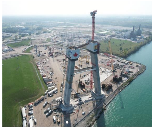
Canadian bridge tower work

The towers' final height will be 220 metres, or 722 feet high.