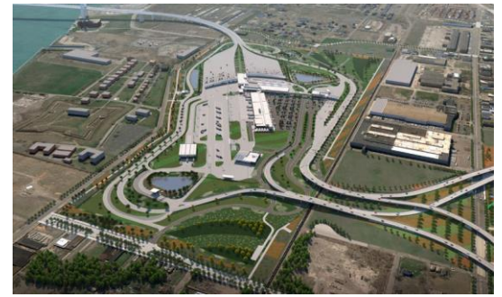
Future I-75 ramps to connect to US POE

To support activities underway on the Michigan Interchange, a number of road closures are necessary and will continue to be ongoing. Advance notification will continue to be issued to keep the travelling public informed about upcoming closures. Access to adjacent properties and emergency services will also be maintained.