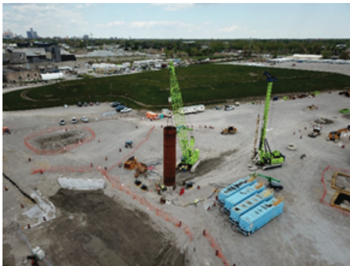
Test shaft work at the Canadian project site