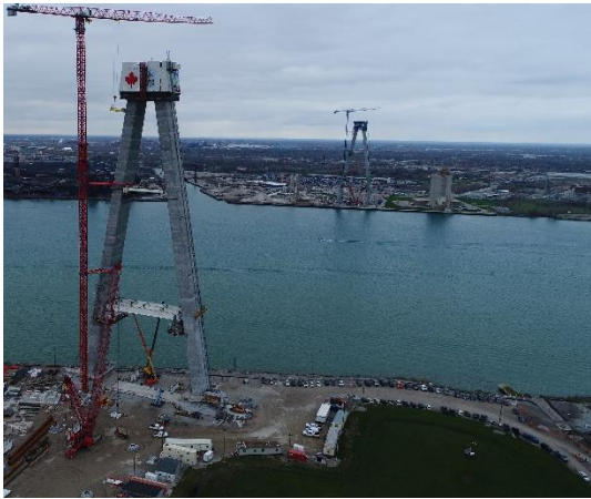
Canadian and US Bridge Tower construction