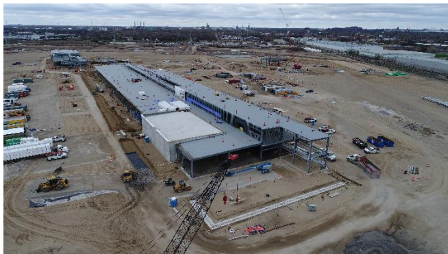
US Port of Entry facility construction.

The primary inspection lanes and toll booth construction has begun, with excavation and foundation work well underway.