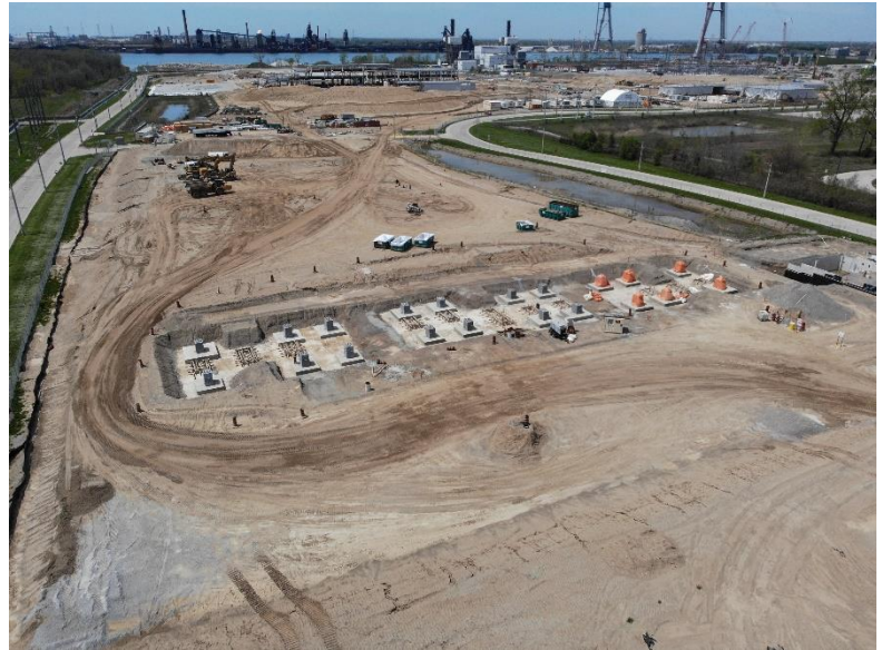
Canadian Port of Entry toll booth construction.

Nine of 12 POE facilities are currently under construction. Some are in early construction with excavation and foundation work underway while others are receiving roofing, building facade and interior fit-out (floors, ceilings and furnishings) installations. The project team expects to begin construction on the remaining three facilities within the coming months.