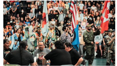
First Annual Alumni & Student Pow Wow, June 2022.

Two Pow Wow events will be hosted, along with March break and summer camp programming to engage local Indigenous and non-Indigenous secondary-school students.