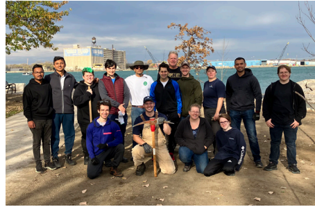
In fall 2022, 43 large potted native hardwood trees were planted in Sandwich through Essex Region Conservation Authority's (ERCA) Triple Tree Impact initiative.