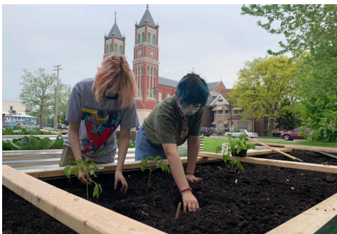
Community gardens, Southwest Detroit.

The youth-driven community center will offer green programming, community education and undergo infrastructure improvements.