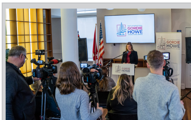
Project representatives announced an increase in funding for the Community Organization Investment initiative on November 30, 2022.

See page 2 for more details on the selected projects.