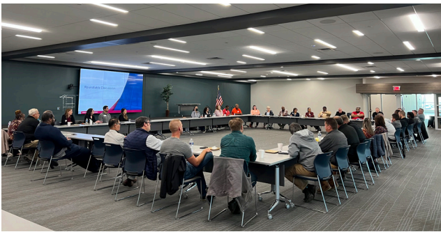
Trades-Specific Workforce Development Steering Committee, Detroit Carpenters and Millwrights Training Center, November 2022.

Information about training and employment opportunities on the project is available on the opportunities page of the project website.