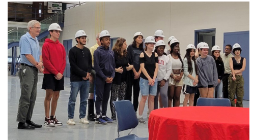
University of Detroit Mercy hard hat ceremony in September 2023.