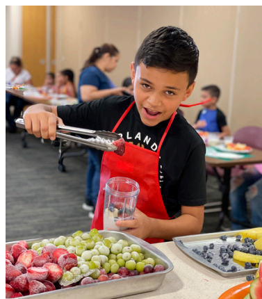
Over 100 Southwest Detroit youth learned about nutrition and healthy eating during CHASS cooking classes.

Right: Art created during art therapy at Journey Home Hospice in Sandwich.