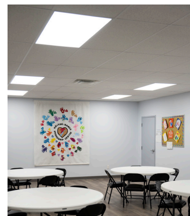
A new drop-down ceiling at the Helping Hands Friendship Centre provides a comfortable space for participants.