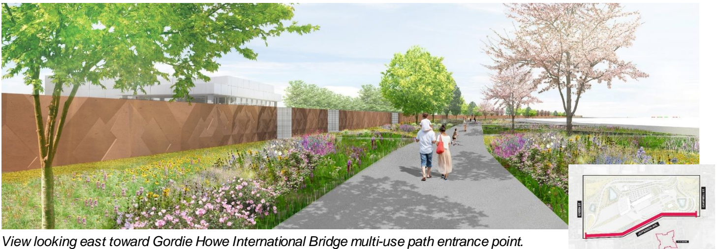
View looking east toward Gordie Howe International Bridge multi-use path entrance point.

It is anticipated that this feature will be constructed in 2023 or 2024.