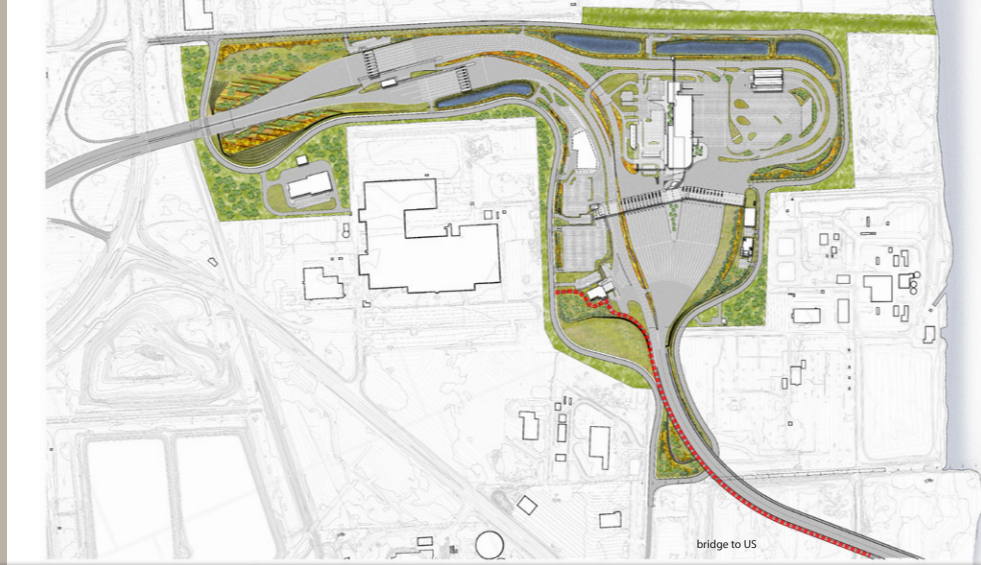
Canadian Port of Entry